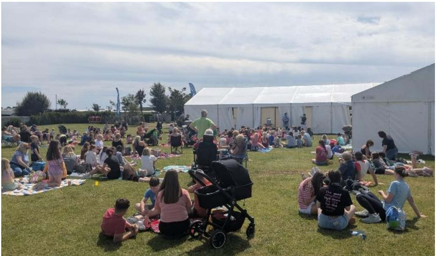
Above: The family picnic is an opportunity to bring along parents, grannies, grandas & friends to CSSM, so they can hear the gospel and see what their children are doing over the two weeks.