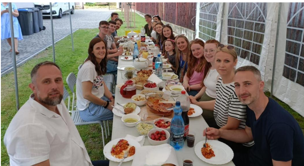
Above: The Polish and NI teams together eating a Polish meal before camp started the next morning. This followed, with a time of prayer and devotion.

One moment that stood out to me was during a church prayer meeting. Our team prayed in English while the Polish church prayed in Polish. As I listened, I was struck by the reminder that God understands every word. There is no language barrier for Him. He hears every prayer, from every person, wherever they are. This experience showed me how vast God's kingdom truly is. Seeing the Polish church faithfully serve their community encouraged me to be bolder in my own faith and reminded me that God can use even small acts of service to make a big difference for His kingdom.