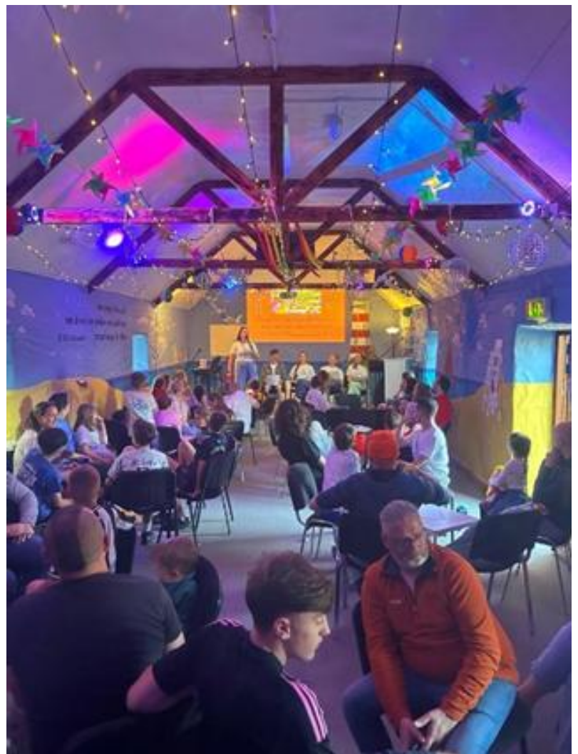
Above: Mullartown house decorated for summer Camps