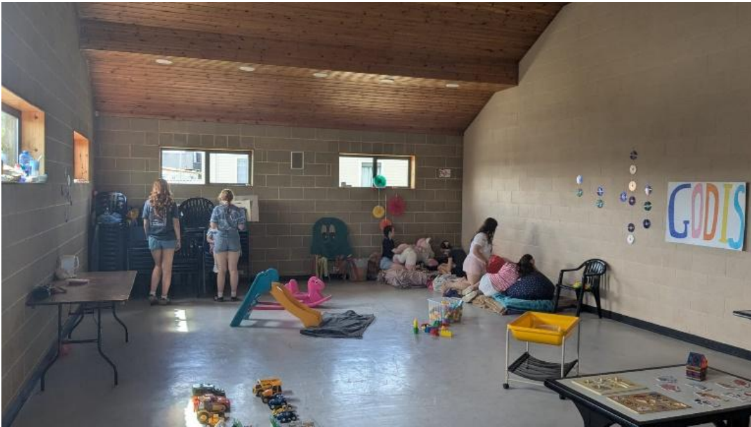
Left: The hall where the Special Educational Needs section meet. This is the second year the SEN section (Jellyfish) has been able to meet as part of CSSM. Children can sing songs, make crafts and enjoy sensory play during the session.