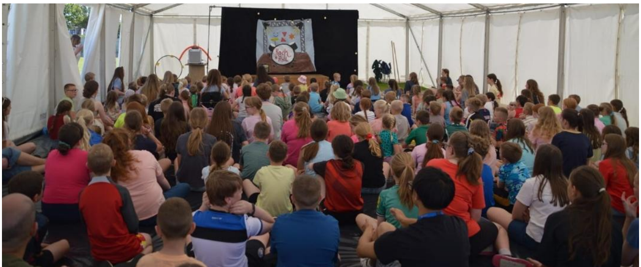
Above: Children packed into the big white tents at Cranfield CSSM