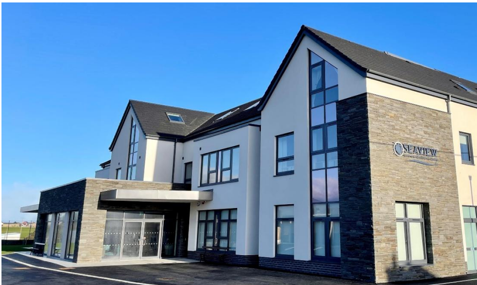
Above: Seaview CEF Christian Camp & Conference Centre. The hub for many CEF Camps across the summer months, including Mourne Junior Camp and CEF North Dublin Teams.

"The LORD BLESS you and KEEP you; the LORD make his face SHINE on you and be GRACIOUS to you; the LORD turn his face toward you and give you PEACE." NUMBERS 6:24-26